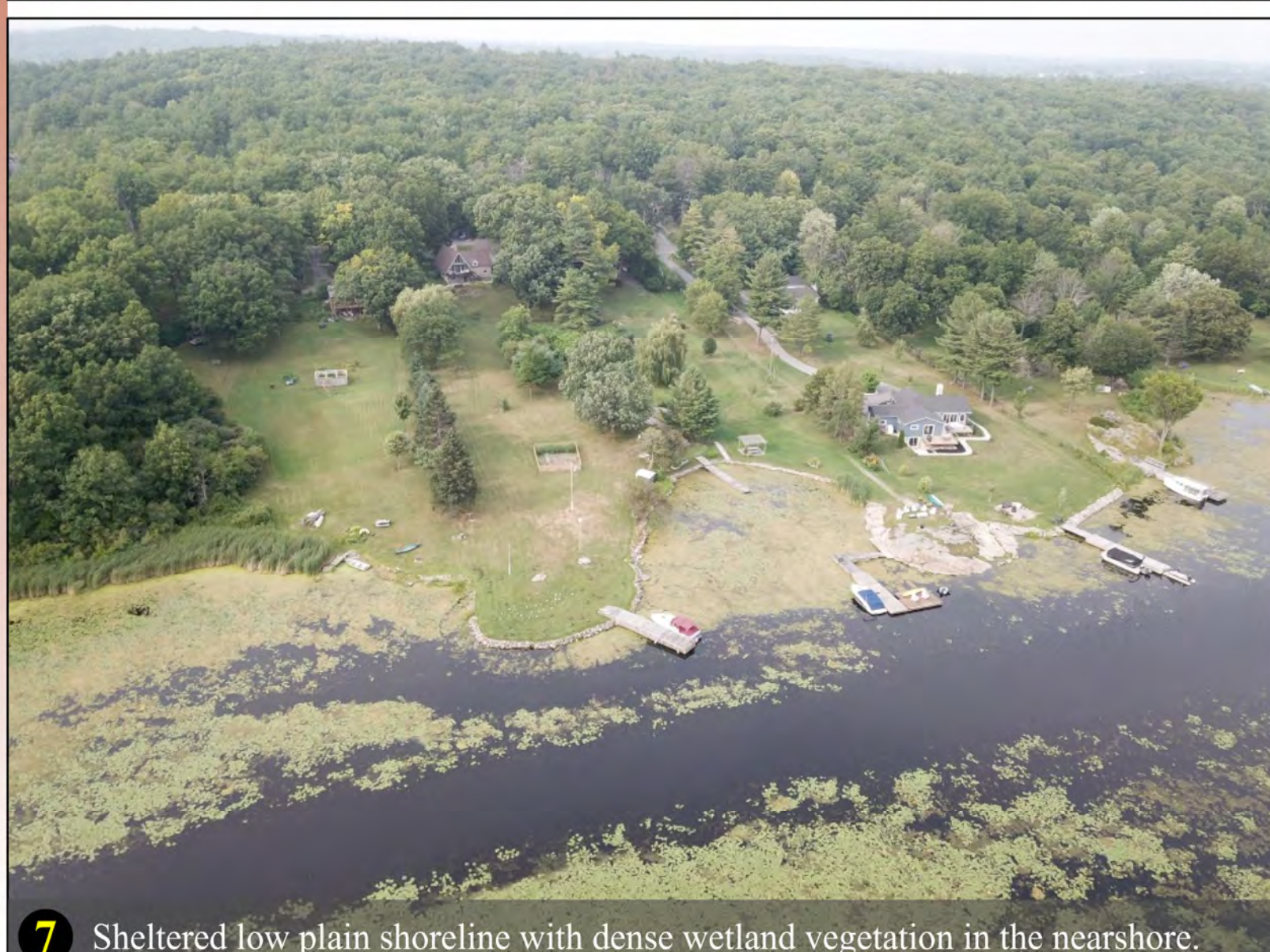
7 Sheltered low plain shoreline with dense wetland vegetation in the nearshore.