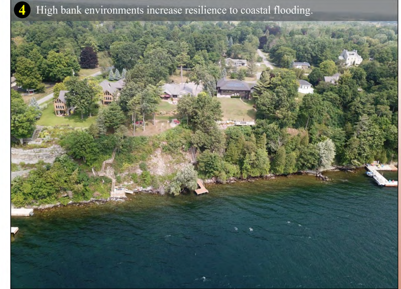
4 High bank environments increase resilience to coastal flooding.