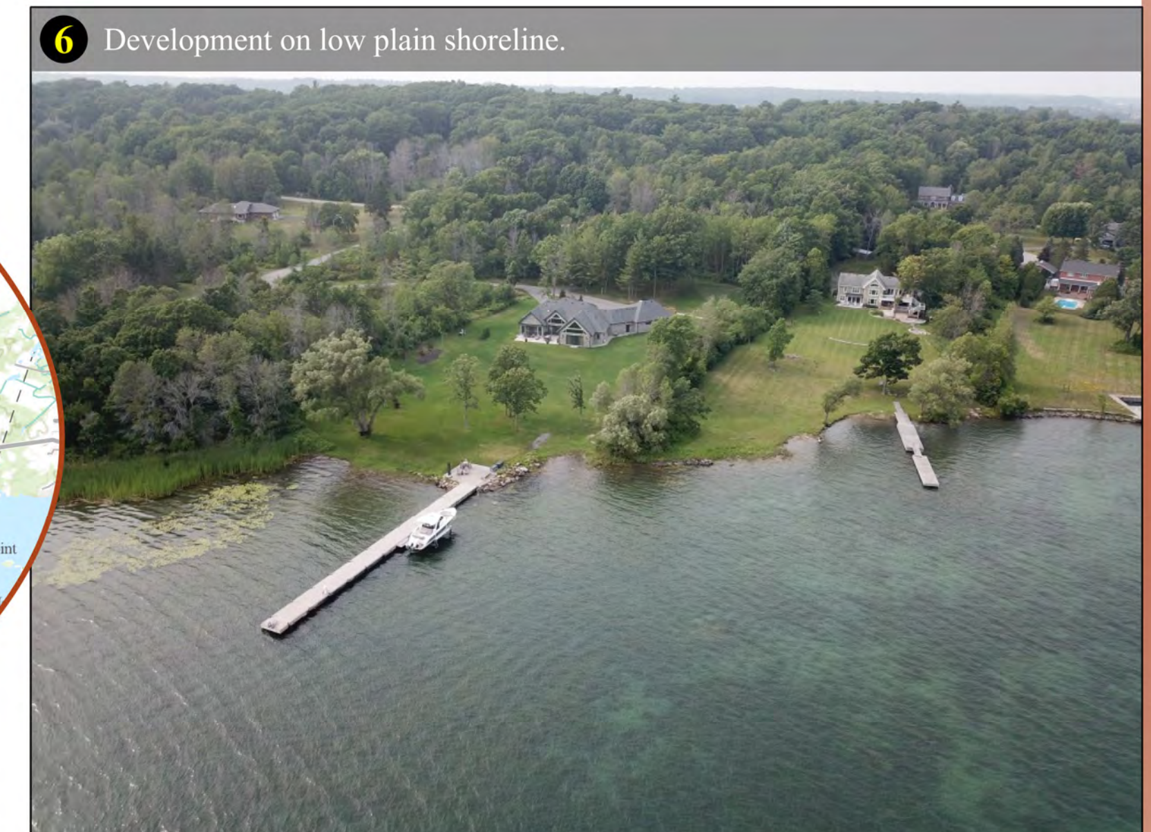
6 Development on low plain shoreline.