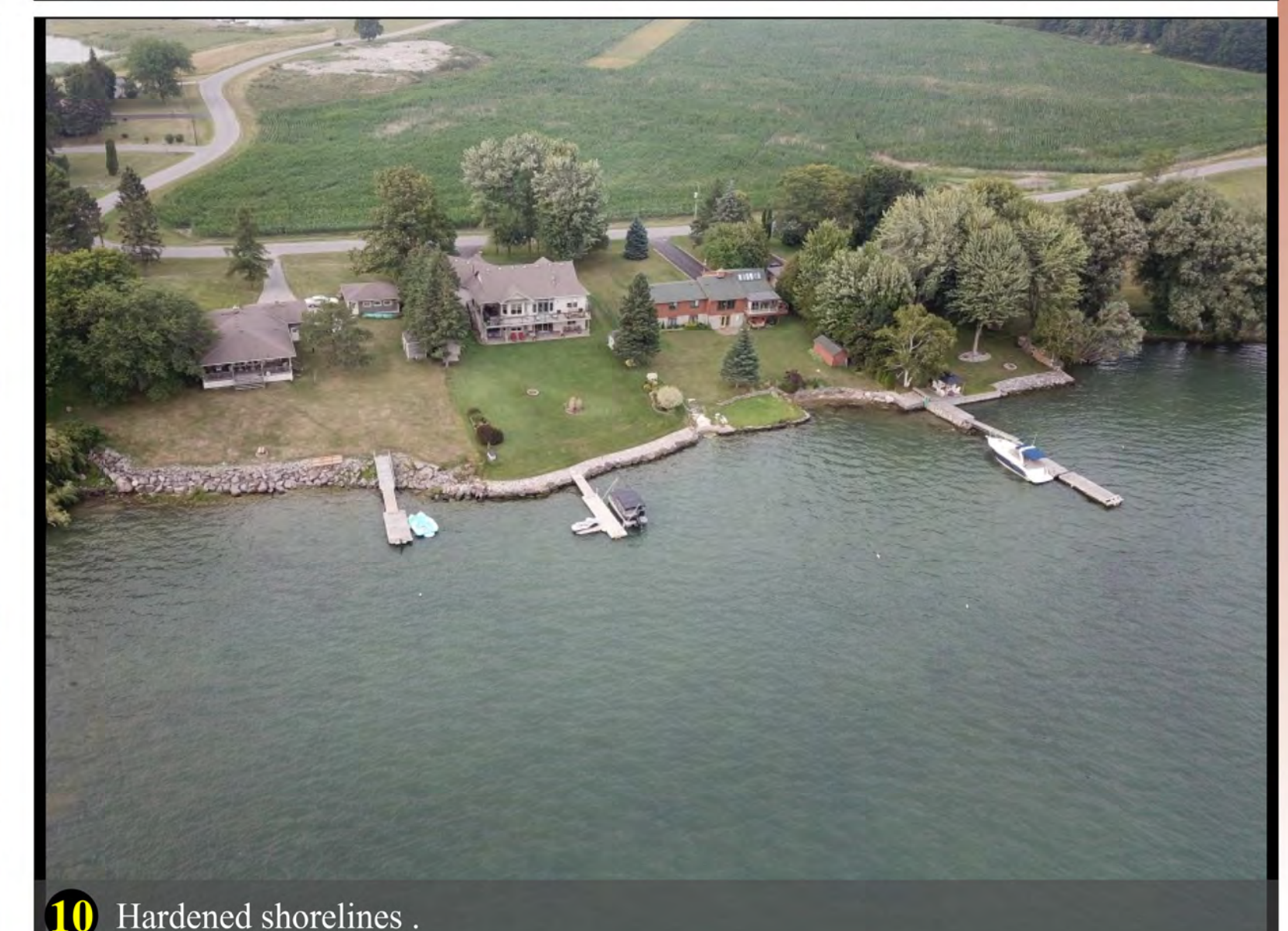
10 Hardened shorelines .