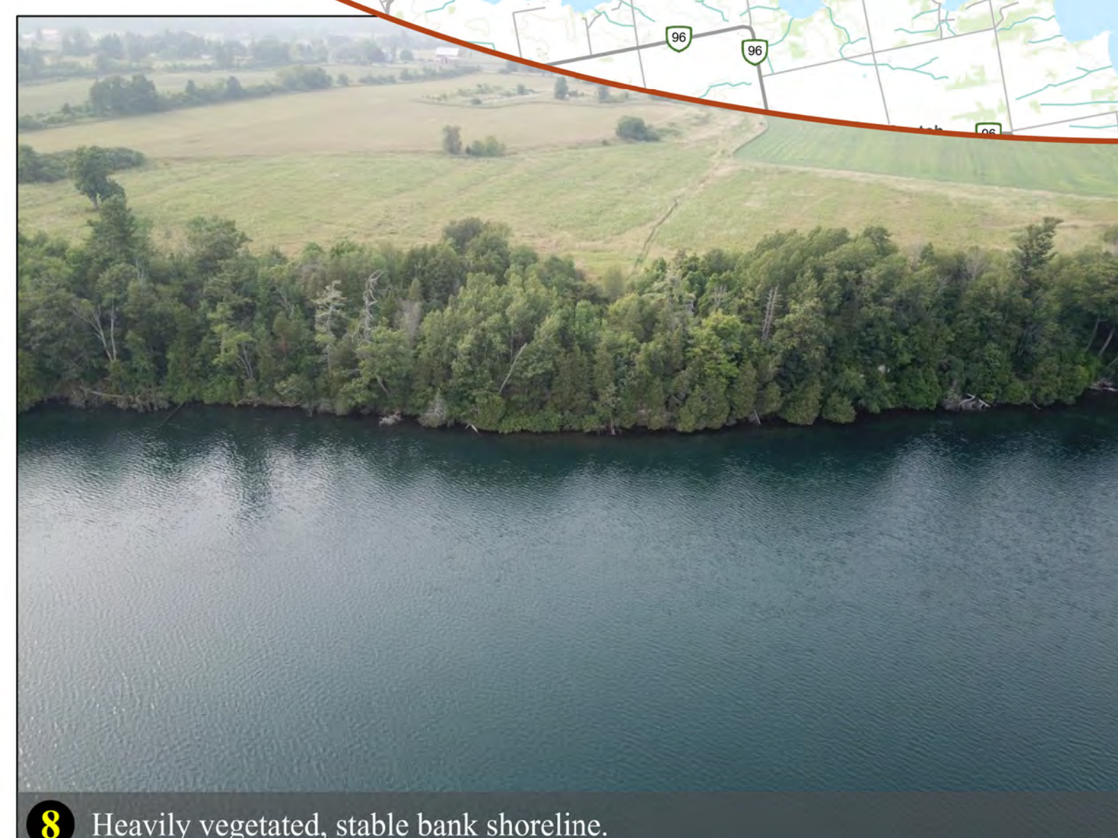
8 Heavily vegetated, stable bank shoreline.