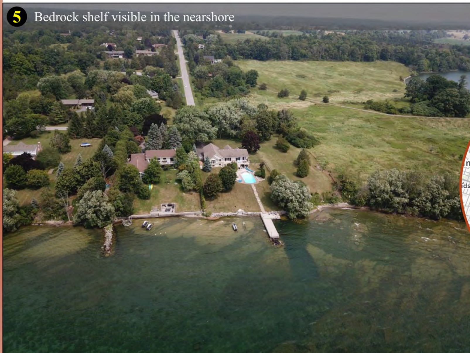
5 Bedrock shelf visible in the nearshore