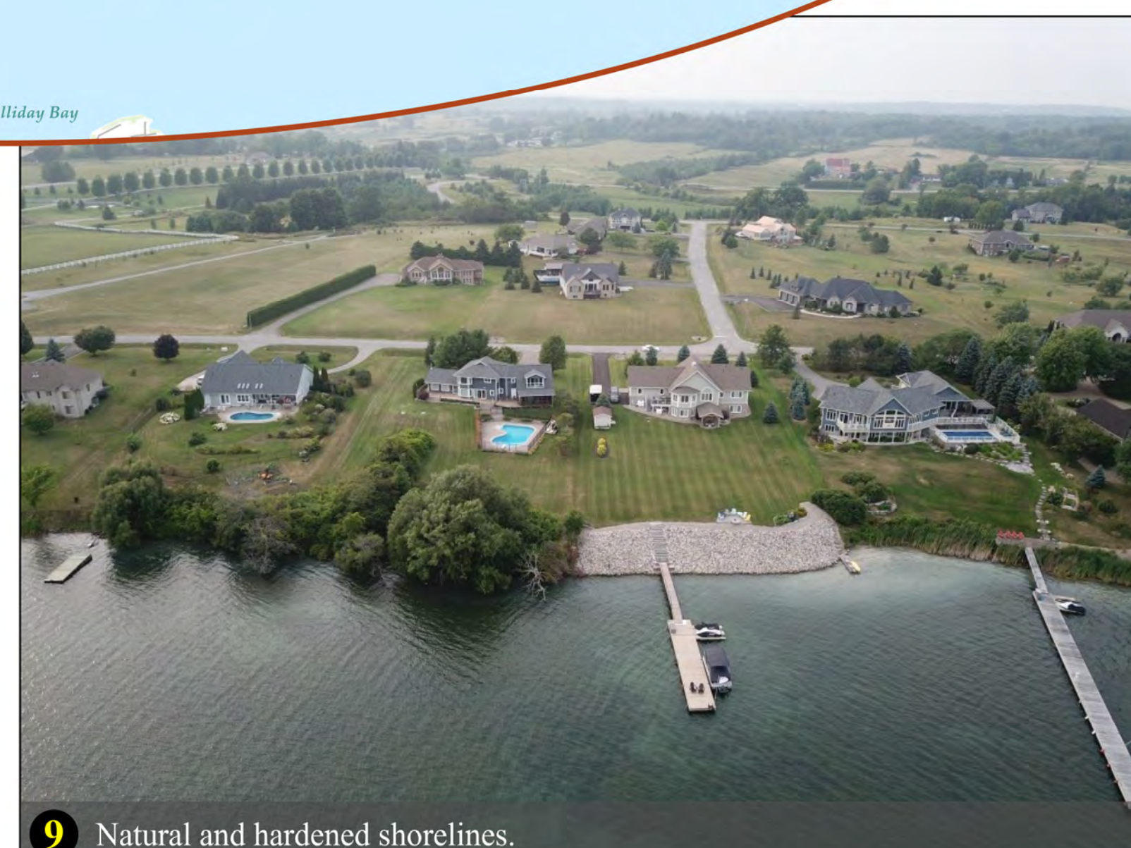
9 Natural and hardened shorelines.