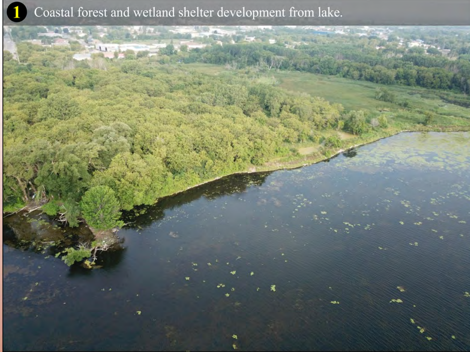
1 Coastal forest and wetland shelter development from lake.